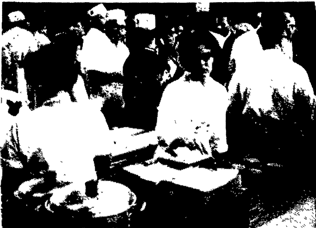
THE CROWDS at the Farm Show this year were less than usual, but you couldn't tell it at the food stands about 12 noon, Tuesday. In the Lancaster Farming Photo,

the members of the Mechanics Grove Church of the Brethren are very busy selling hoagies, hamburgers and chocolate milk, to the line of hungry people.