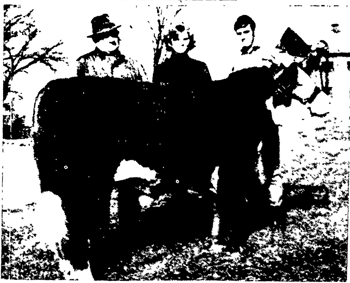
OPEN SHOW Hereford breed reserve champion at the Pennsylvania Livestock Exposition in Harrisburg this week is