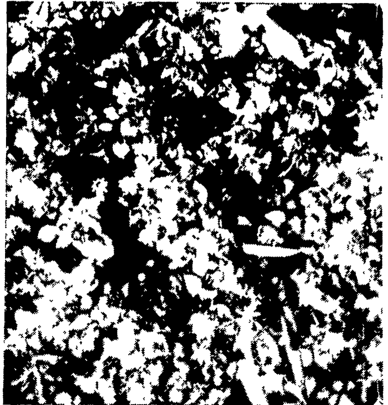
If not effectively controlled, alfalfa weeds like chickweed (above) can reduce hay quality, cut yields, and shorten stand life.