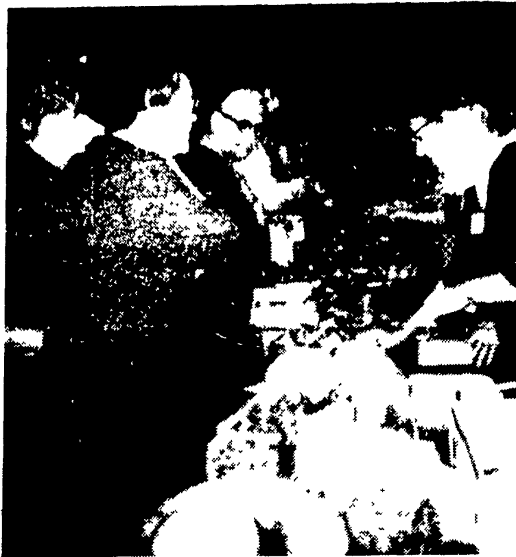
AT THE BAZAAR TABLE, making selections are County Farm Women Conventioneers.