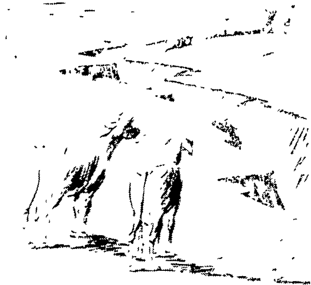
"ALL THAT EROSION, AND MAN CALLS US THE DUMB BEASTS OF THE FIELD!"