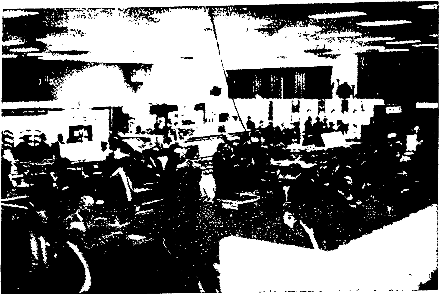
THE NEPPCO SCENE that greeted visitors to commercial exhibits as they stepped in the door of the lower

level hall at the Chalfonte-Haddon Hotel.