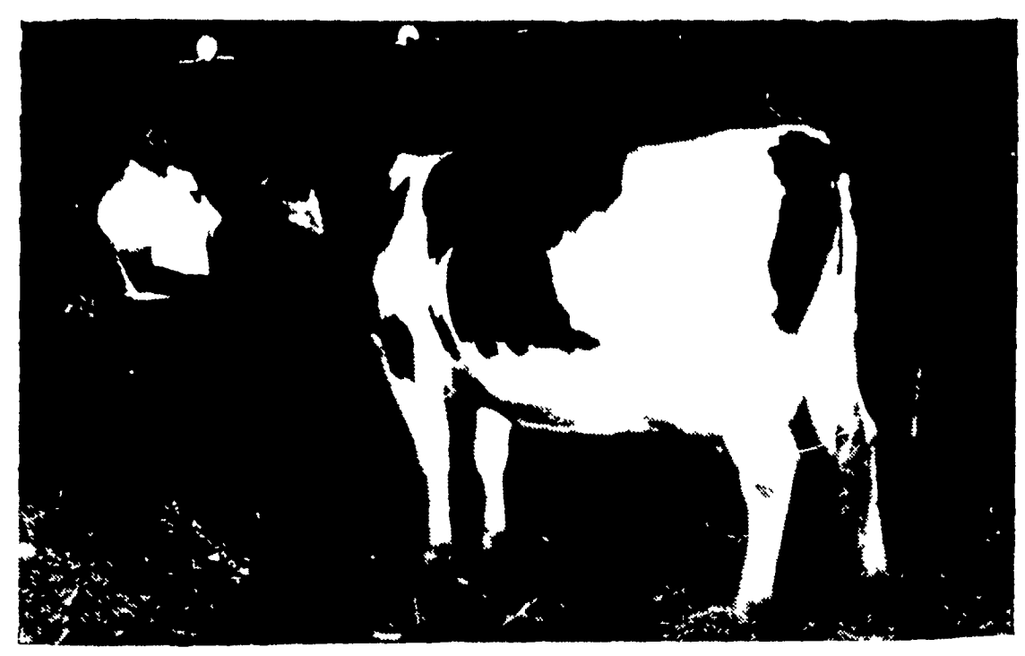
SUNNY CRAFT JULIE is shown to the grand championship at the Manheim