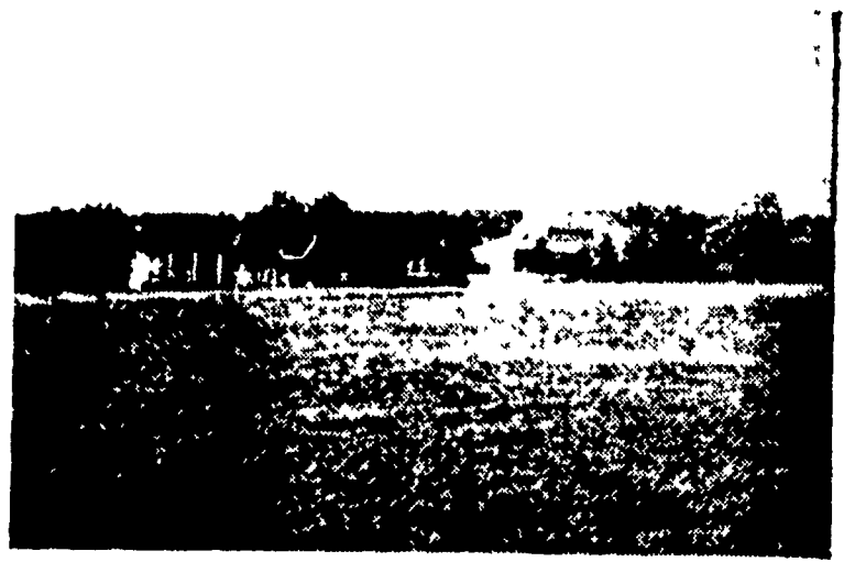
THE MYSTERY FARM at the Solanco Fair above is owned by Howard Groff and is located just east of Quarryville.