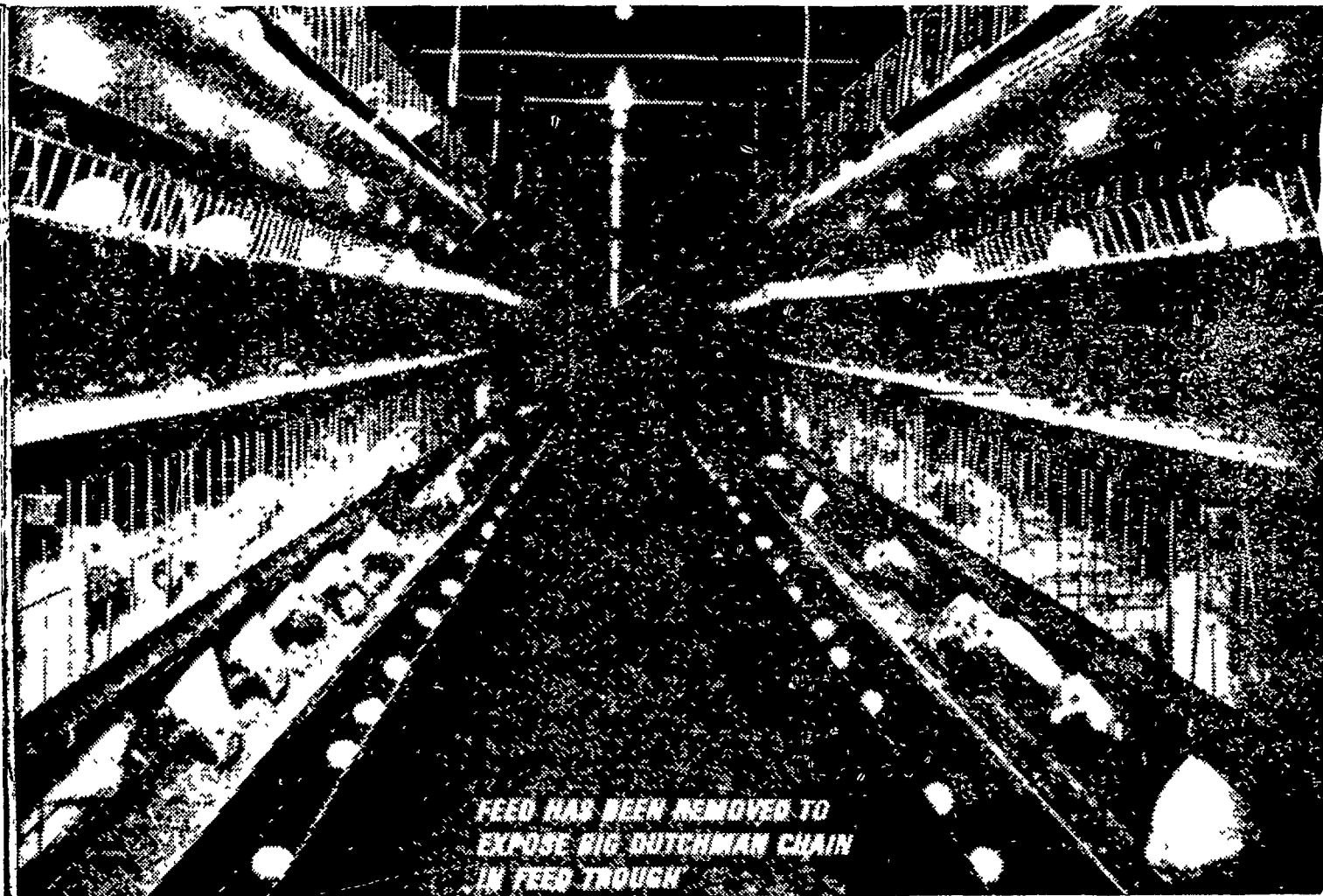
FEED HAS BEEN REMOVED TO EXPOSE BIG DUTCHMAN CHAIN IN FEED TROUGH

With The Big Dutchman Low-Cost Approach To Cage Automation