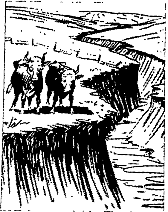
"When we were calves we could hop across this ditch!"