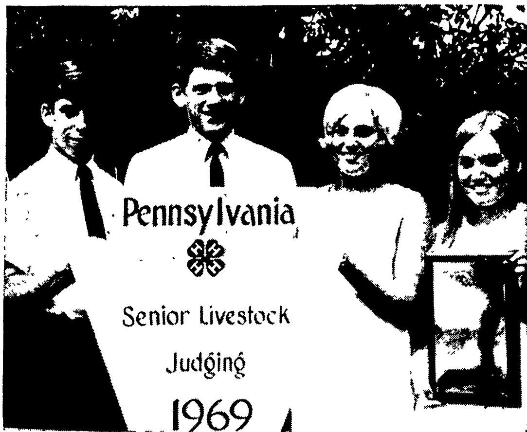
THE SENIOR LIVESTOCK JUDGING TEAM brought back first place honors to Lancaster County Wednesday when they returned from their contest held at Penn

State as part of State 4-H Days. They matched the 1968 team in accomplishing the feat.