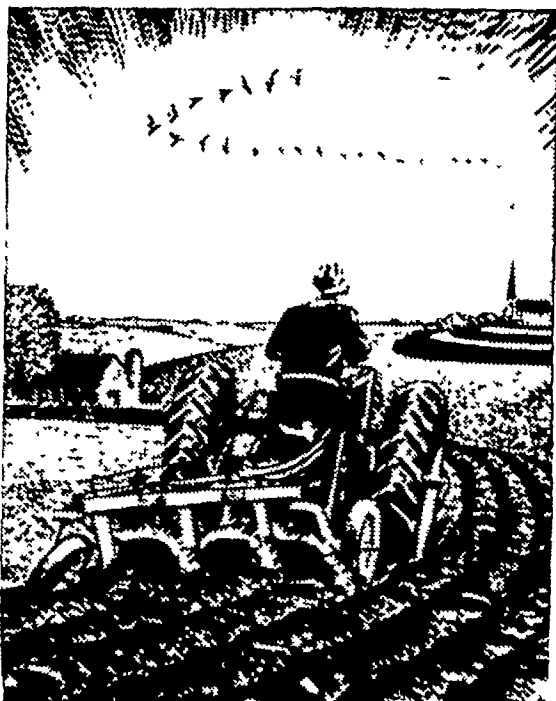
he that ploweth should plow in hope