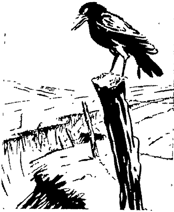
Erosion is nothing to crow about.

Soil Testing The Penn State Soil Testing laboratory has gotten a real workout this year when 900 soil samples per day were processed during the rush season. The peak season was from the last week of March until the first of May. It is expected that 15,000 samples will be tested by the first of July. This high volume of work was expected and the lab was tooled to test the samples with the quickest possible service. From the time a sample is received until the report is mailed, it takes from 7 to 10 days. When mail time is considered in getting the sample to and from the lab a 2-week period is utilized. Local farmers and gardeners are urged to allow this amount of time for the week before needing the information.