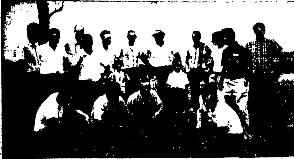
GARDEN SPOT YOUNG FARMERS inspect no-till planted corn field. The group toured several farms Thursday afternoon