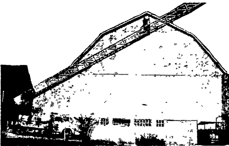
Aerial Ladder Equipment Used To Paint Your Farm Buildings