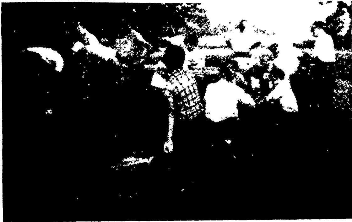
EIGHTY QUARTS OF ICE CREAM, to observe June Dairy Month were made