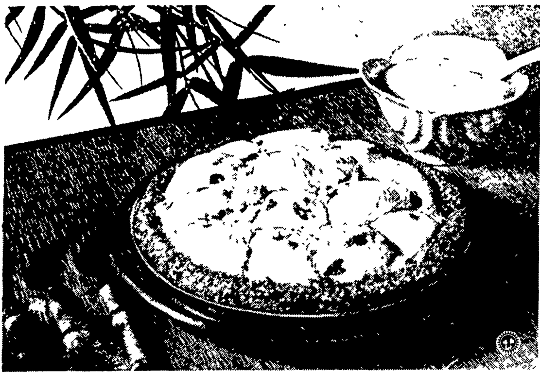
A "sundae for eight" is this splendid butter pecan ice cream pie with its apricot sauce topping.