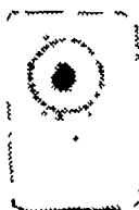
Time Clock Assures periodic fan operation on a 10 minute repeating cycle.