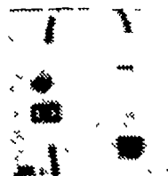
Time Clock and Single Stage Thermostat Panel Time clock controls the fan on a ten-minute repeating cycle or thermostat will operate the fan as needed.