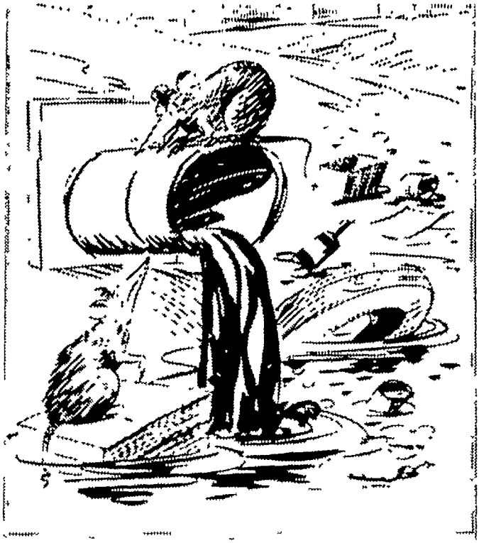
This Is Litter-ally Our Home!