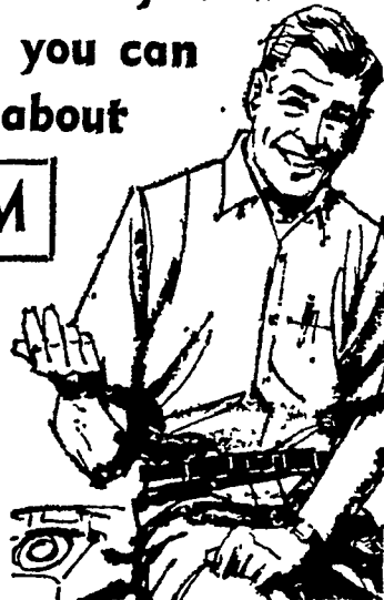
*All prices are suggested list prices, f.o.b. factory.

For just $6,640* more you can add the Uni-Combine, a grain platform and a cornhead!