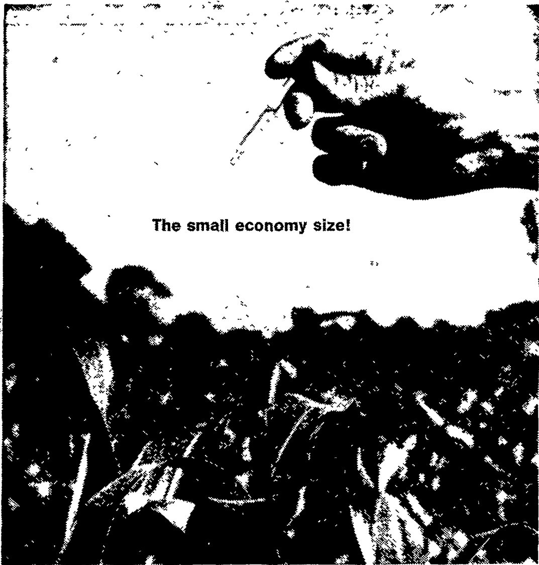
The small economy size!

A drop of Banvel controls broadleaf weeds. Cost? A drop in the bucket.