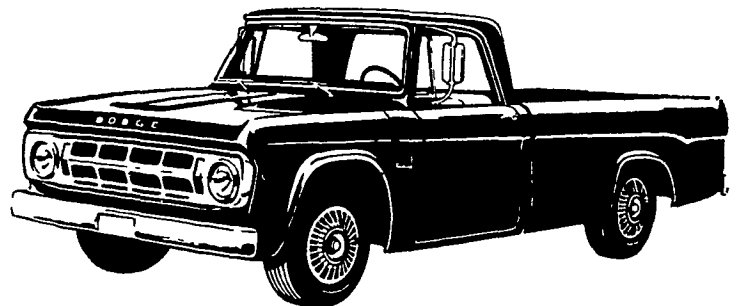
Sweptline Pickup—Front View

What we mean is that we trust you will COMPARE trucks before you buy