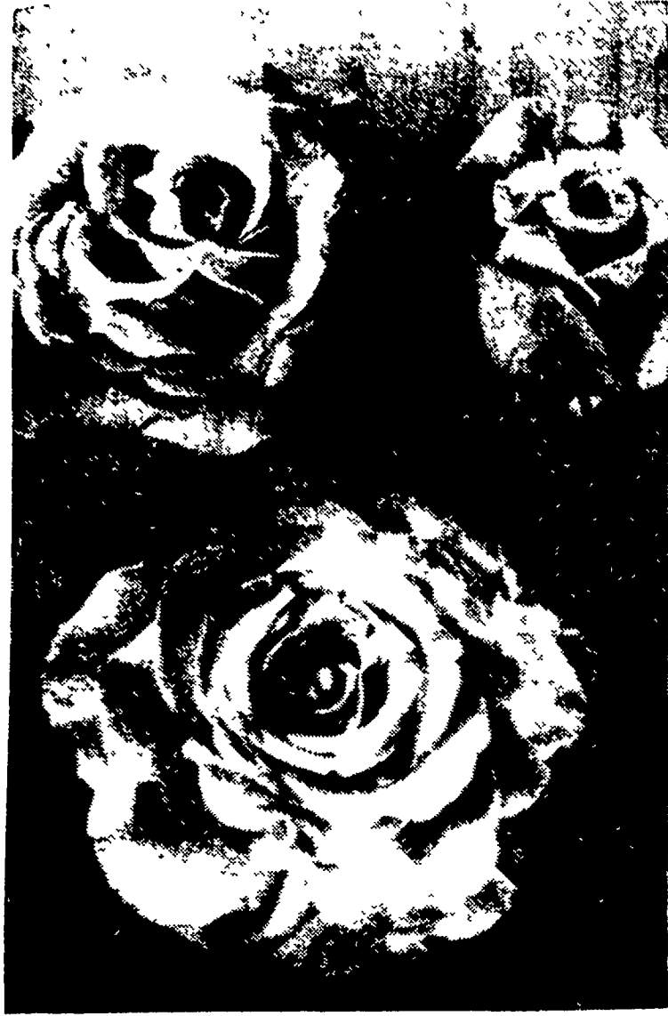
ANGEL FACE. The only lavender rose ever to win an All-America award. A strong growing, fragrant, bright lavender floribunda.

explored, each hybridizer with his own theories. Even the laboratories of chemists have been invaded and have contri-