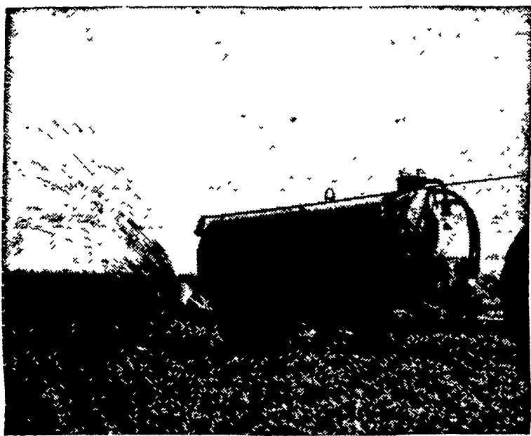
"BETTER-BILT" LIQUID MANURE SPREADER

also included with the correspondence course. Send your name and address with $3.00 to Small Grains, Box 5000, University Park, Pennsylvania 16802 There are no other charges and a complete course copy comes to you by mail We show courtesy to others, not because they are ladies and gentlemen, but because we are