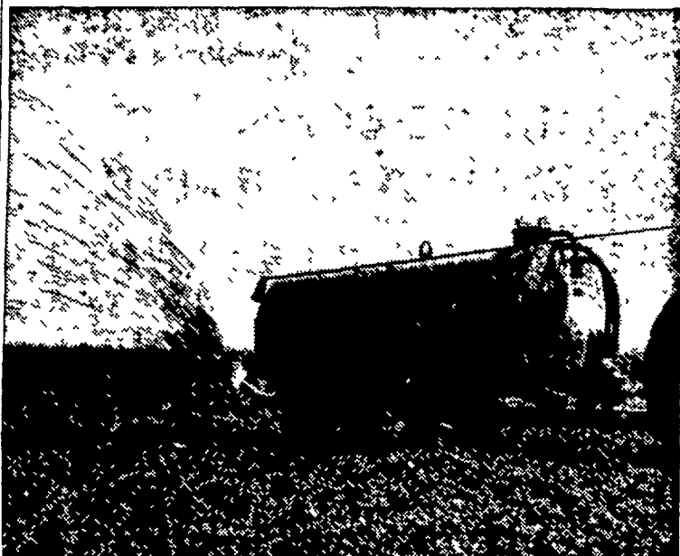
"BETTER-BILT" LIQUID MANURE SPREADER

More than 130 shipwrecks have occurred around the Falkland Islands in the South Atlantic Ocean because of the strong winds, which average 25 miles per hour, and a lack of beacons.