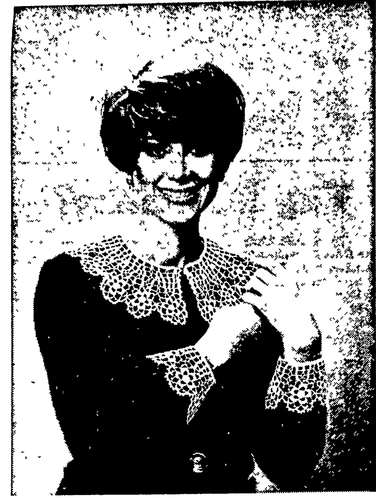
THE COURTLINESS OF LACE dazzles basic black. Exquisite collar and cuffs lead deep velvets, rough wools into a new realm of style. Each piece is circled round with flower medallions, caught in the scalloped edging. The collar is 41/2" wide; each cuff, 31/4" wide. The lace is crocheted of "Big Ball" Mercerized Crochet. Free instructions are available by sending a self-addressed, stamped envelope to the Needlework Editor of this newspaper along with your request for Leaflet PC 4462.

cups coconut 15-oz. can sweetened con-1 densed milk