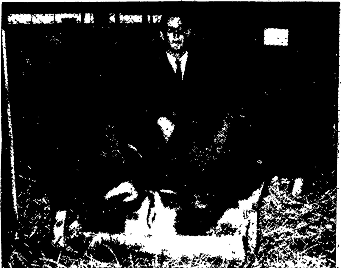
WINNER IN THE BERKSHIRE SOW VOCATIONAL CLASS at the Pennsylvania Farm Show this week in Harrisburg