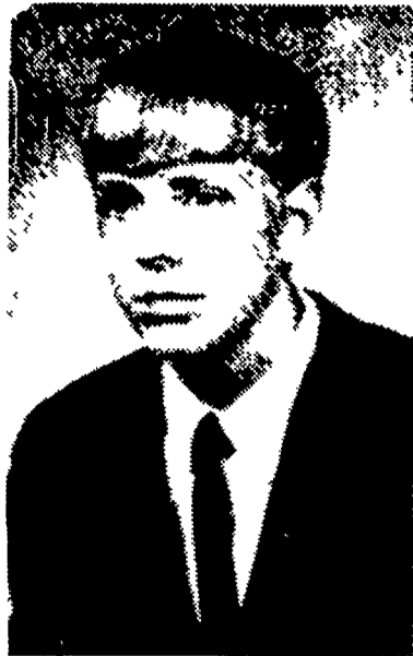
Henry H. Hershey