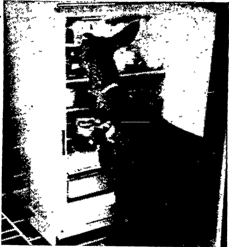
Would you like it from the bottle . . . Or maybe you want to be hand fed? . . . Oh, I see, you want to get it yourself.