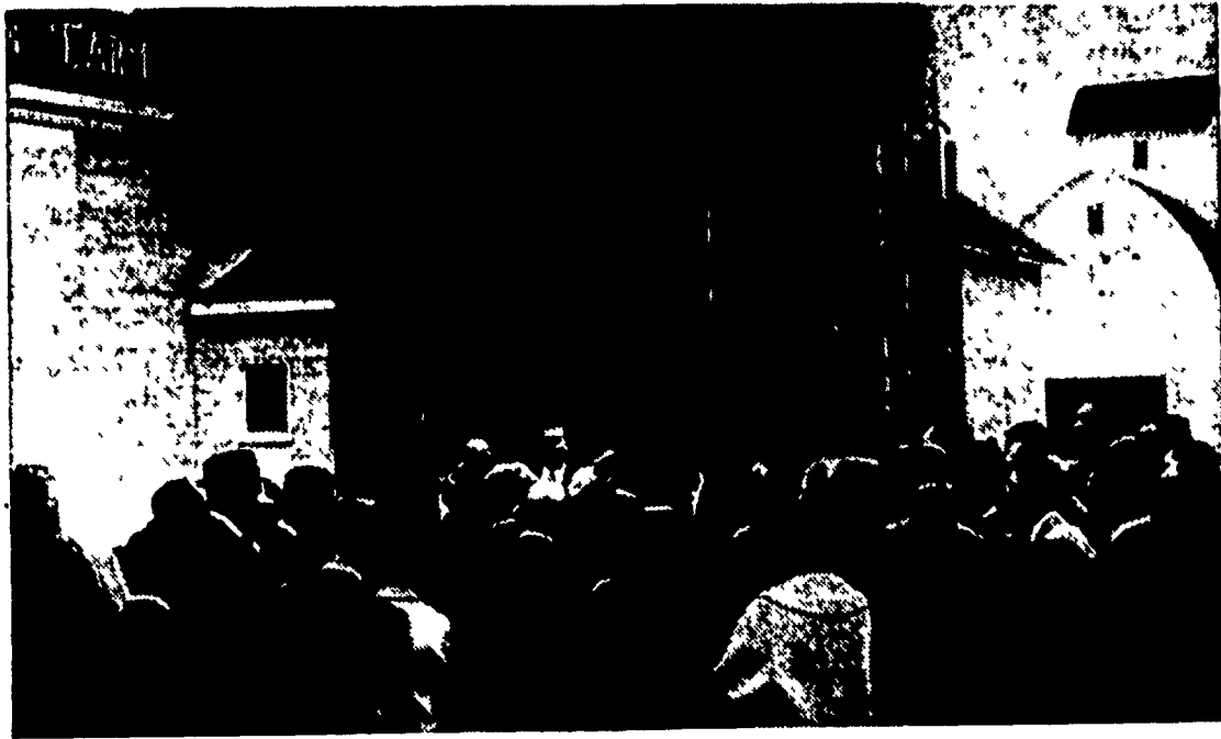
County Dairymen visited the century-old Hoard's Dairy Farm at Ft. Atkinson, Wis. as part of a tour last week sponsored

by Penn-Jersey Harvestore Systems, Inc. of New Holland.