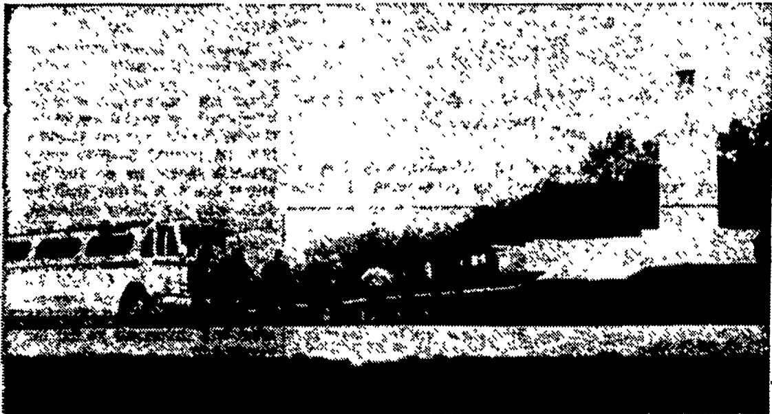
THE ETERNAL FLAME at the Gettysburg Battlefields visited by the Lancaster County Poultry Tour on Tuesday. The base

is inscribed with the statement by Lincoln that reads, "With Firmness In The Right, As God Gives Us To See The Right".