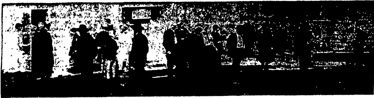
THE POULTRY TOUR at the L. M. Sweitzer Farm at Dover. The Sweitzer's have a 1400 layer operation

housed on a flat deck eight birds to a cage.