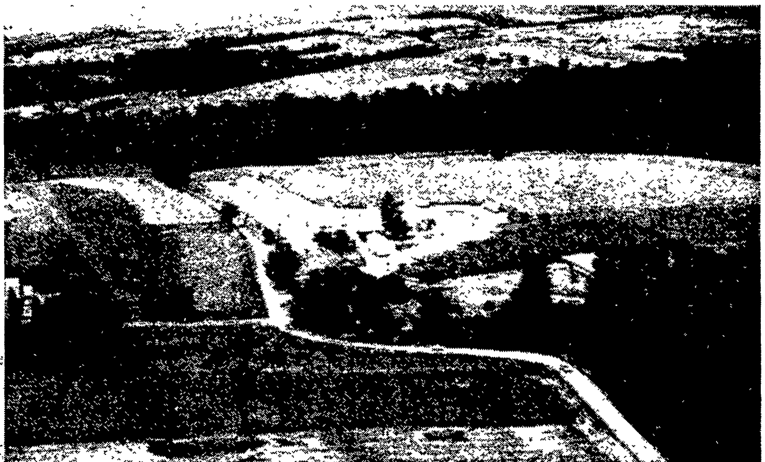
SPREAD EAGLE FARMS, INC. An aerial view of one of the 20 farms including 2500 acres in Schuylkill County visited by the NEPPCO Tour this week. Spread

Tuesday, Oct. 15 —15-18 FFA National Con- (Continued on Page 5)