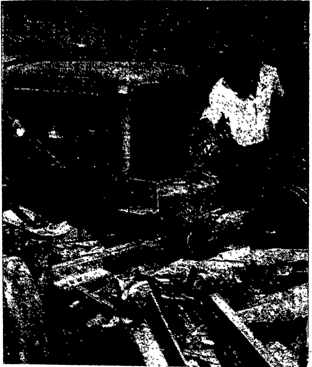
ROSS WALTER shows the area from pick-up to lath where the stalks are moved by a chain with fingers that grab the butts.

This chain moves only when a stalk is in position.