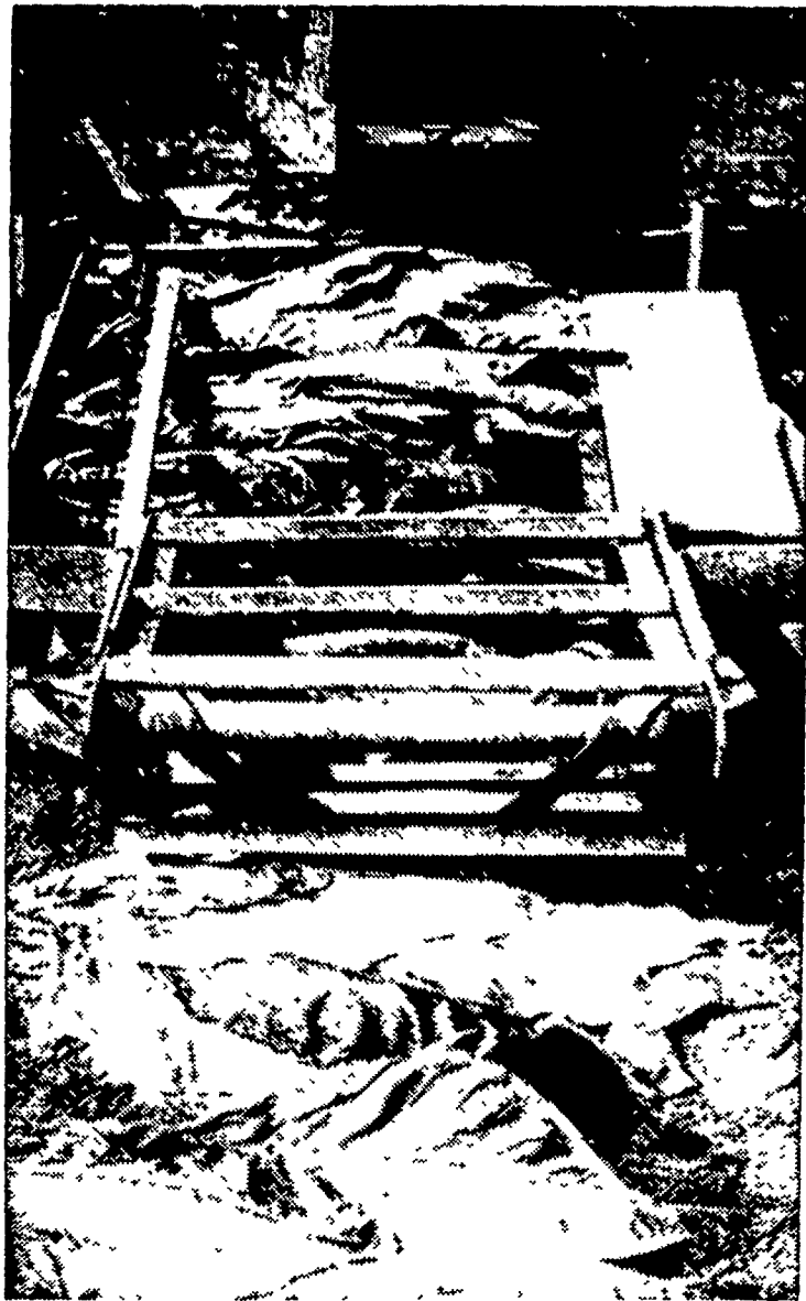
THE PICK-UP on Walter's new tobacco harvesting machine runs under the wilted tobacco stalks and lifts them up to begin the movement over the spear onto the lath.