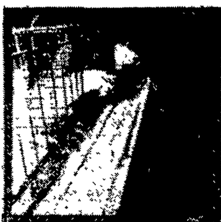
Feed Is Stirred — Desired Feed Level Is Maintained.