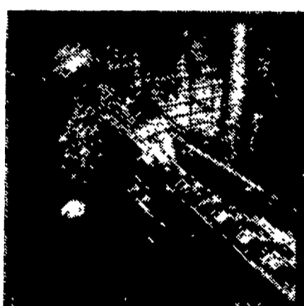
Uneaten Feed Is Removed From Chain And Is Remixed With Fresh Feed.