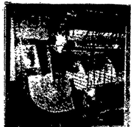
Reverse End of Feed Line.