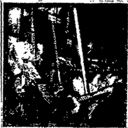
Hopper End Utilizes Minimum Space—Designed for Efficiency of Operation.