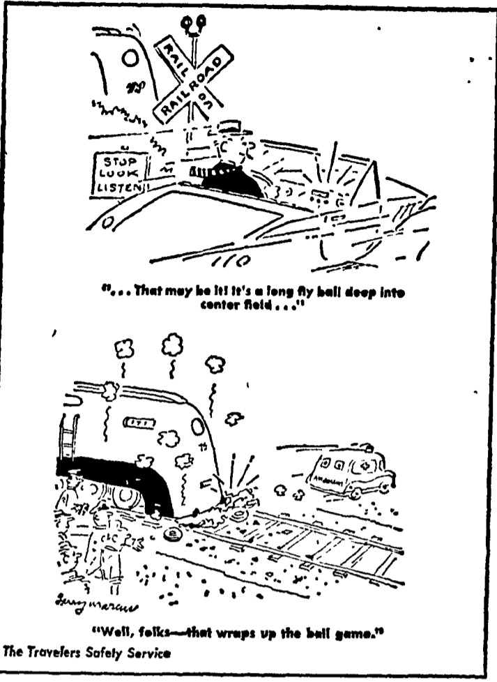
Carelessness and inattention are prime causes of motor vehicle accidents.