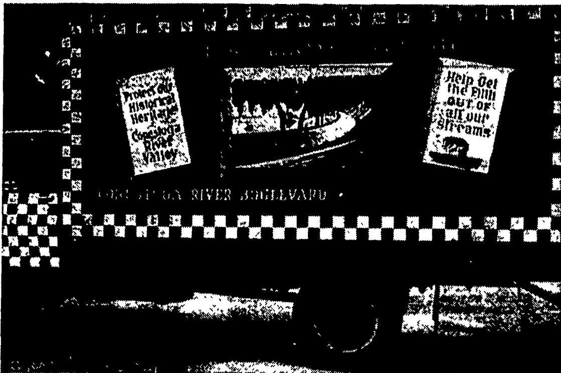
A MOVING BILLBOARD to publicize the continued battle against stream pollution may be seen on local streets and high-

ways. The truck will be out to the county festivals and fairs this fall for the Conestoga Valley Association.