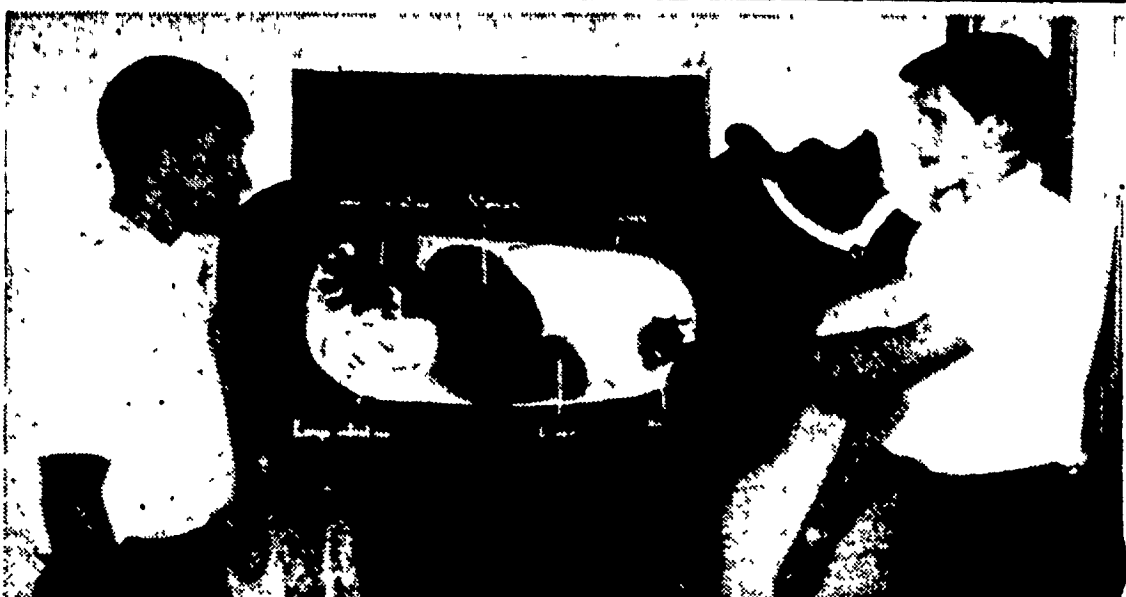
DALE BUSHONG AND MARVIN NIS- SLEY give the top Livestock demonstra-