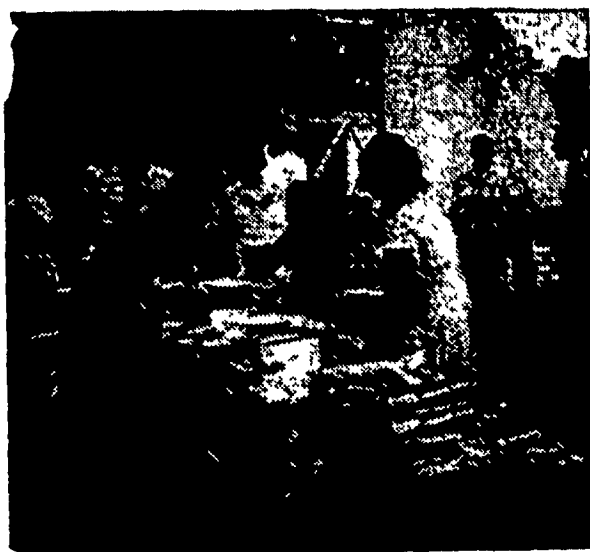
THE FUN SIDE OF 4-H is evident at the 4-H Soil and Water Conservation Club "doggie roast" and picnic. The members, leaders and parents enjoyed this outing at the Vincent Hoover farm near New Providence. The event also included a field trip to observe good con-