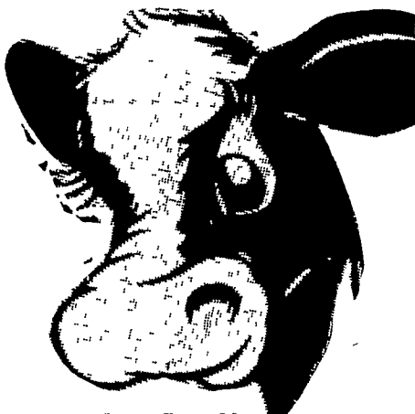
Offer Closes June 30.