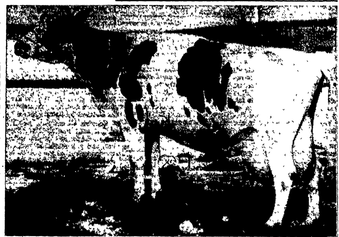
MAPLE DRIFT LUCIFER BEULAH. Very Good, foundation at Maple Drift