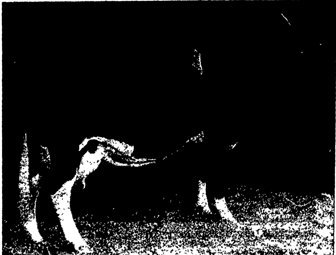
WIGHTWIGH GLENAFTON RACHEL, Excellent 92, foundation cow at Fultonway Farms is still producing at past 18 years.

Empress had only three daughters but all are top producers and all are classified Good Plus. Connie, Good Plus 84, by Landgonhurst Ormsby Burke Lad has 5-11y 365d 29,609m 909f; Kitty,