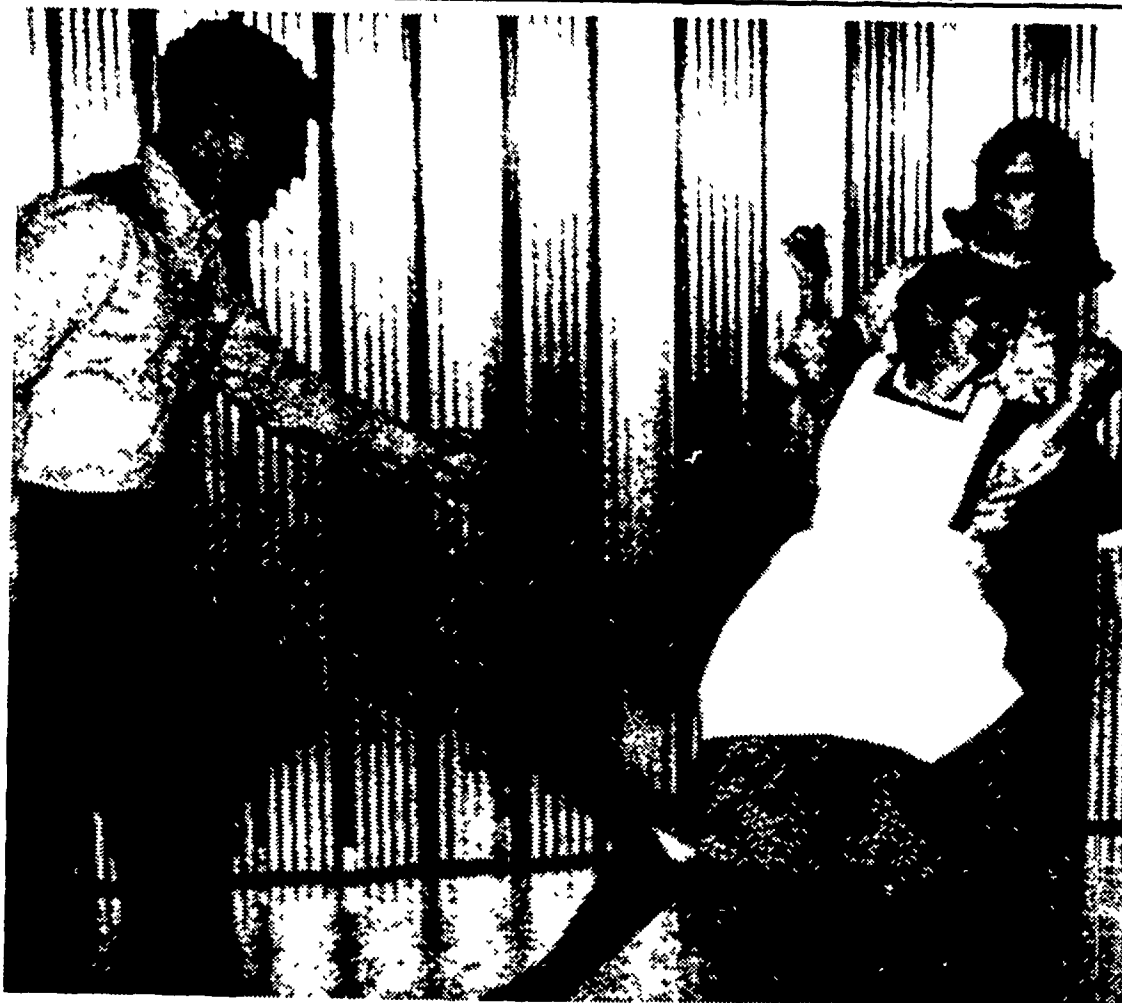
"WHAT KIND OF GAMES IS HE TRYING TO PLAY ANYWAY?" A scene from the up-coming 4-H play to be held April 26 and 27 at the Manheim Township

For a description of over 100 trees for ornamental planting, study the Penn State course. To enroll simply send your name and address with $1.50 to TREES, Box 5000, University Park, Pa 16802. Make checks to PENN STATE. There are no other charges and the course comes to you by mail.