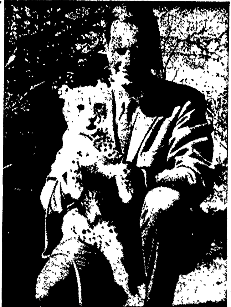
Shown above is Jim Fowler, co-host of the television program "Wild Kingdom," holding "Arthur", a five-month old cheetah. Arthur is trained to Mr. Fowler's commands and makes friends with strangers without hesitancy.

M. S. Yearsley & Sons West Chester 609-2990