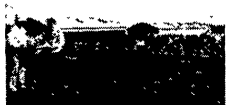
All-steel Buildings: Your nearby Agri-Builder can show you why, on today's best-looking farmsteads, you'll see more Butler Rigid Frame Buildings than any other brand

Your Agri-Builder, like you, is in business to stay He wants to give you first-class service, because he's a local businessman His roots and his capital, time and labor are tied directly to your farming community. See him soon, or write Butler Manufacturing Company, Dept. 100, 7400 E. 13th St., Kansas City, Mo. 64126.