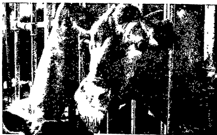
It's New from Wayne Research

32% DAIRY KRUMS plus your grain for Top Dairy Nutrition