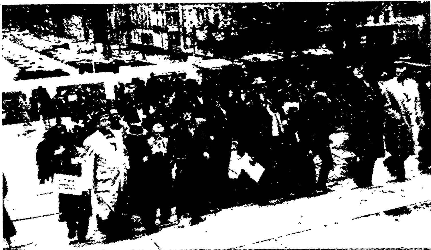
Farmers Oppose Cigar Tax

state tax on cigars and tobacco products other than cigarettes appears to be dead.