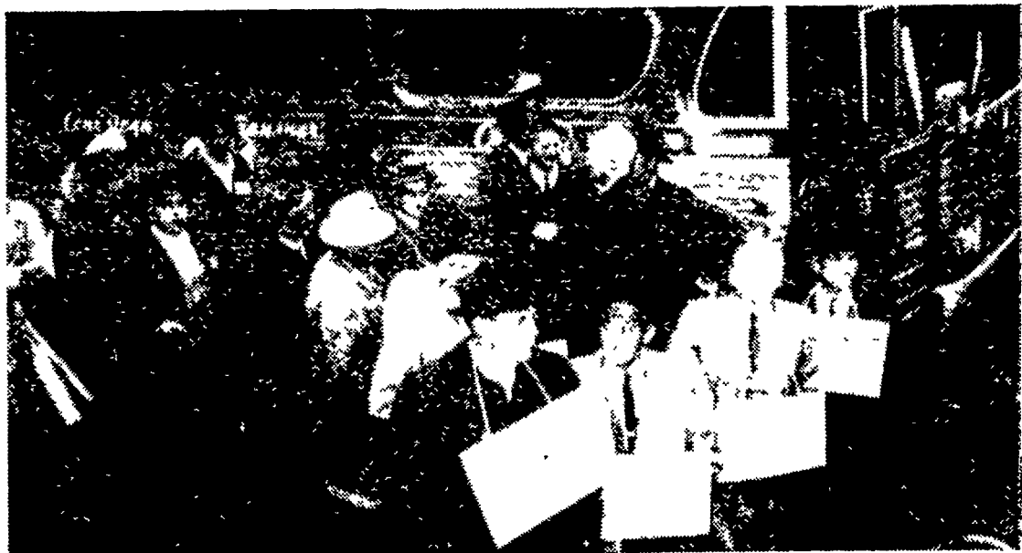
H.B. No. 1893 Unfair To Farmers