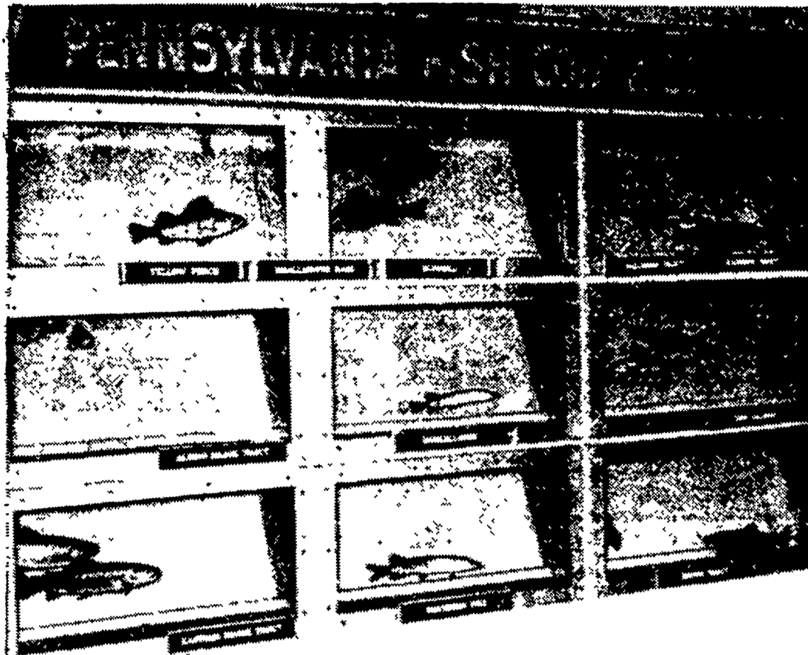
A LIVE FISH DISPLAY by the Pennsylvania Fish Commission at the Soil and Water Conservation Convention this week.