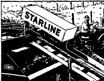
For more power-and time-saving details, see us!