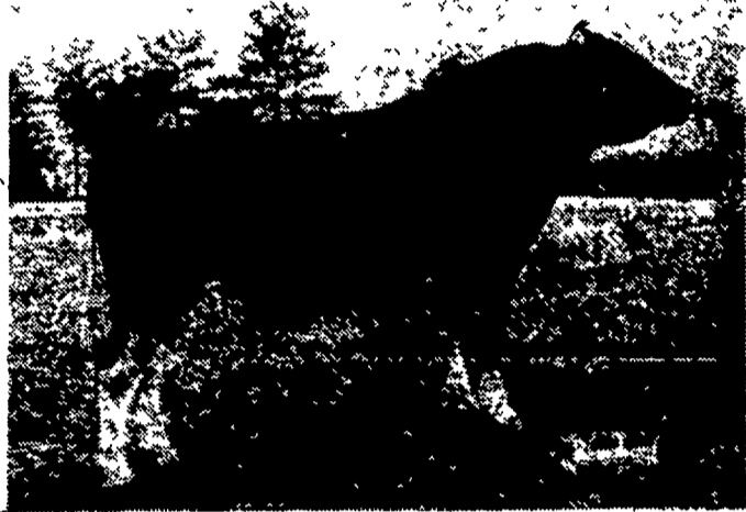
15H121 Eagle Point Design's Bonus — VG

Production: A.B.C. Proved Sire 8 Daus., 8 Rec. Ave. 18,870M 3.84% 721F Increase over Dams +3,670 +.04% +149 Increase over Hdmts. +3,200 + 95 Type: 8 Classified Daus Ave 82.3 Dif. from Expectancy (7 yrs.) +5.95 Sire: Irvington Pride Admiral — EX-92 & GM Dam: Hedge Upwey Design's Queen — VG & GMD 3-10y 362d 2X 20,892 3.7% 791 6-10y 365d 2X 22,475 3.8% 860