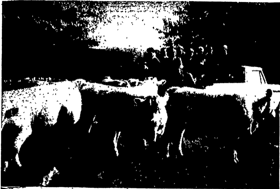
CHAROLAIS BREEDING CATTLE FARM , at Leawood, Kansas. The FFA boys were guests at this farm during their trip to the FFA National Convention.